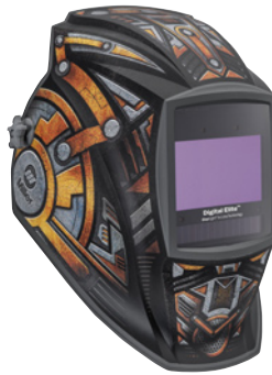
Gear Box™ 296771