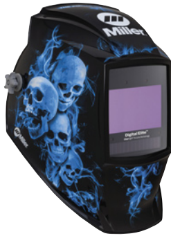
Blue Rage™ II 296774