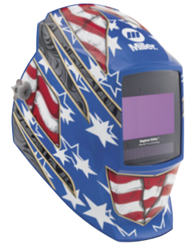
Stars and Stripes™ III 296770