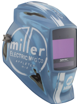
Vintage Roadster™ 296768