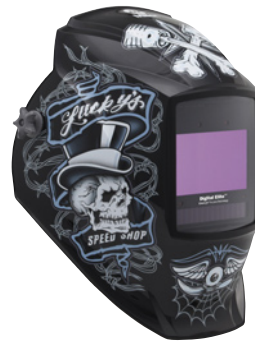
Lucky's Speed Shop™ 296766