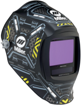
Black Ops™ 296779