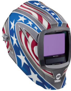
Stars and Stripes™ 296780