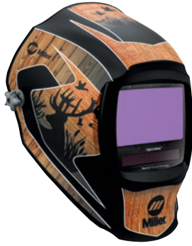
NEW! Outdoorsman™ 296783