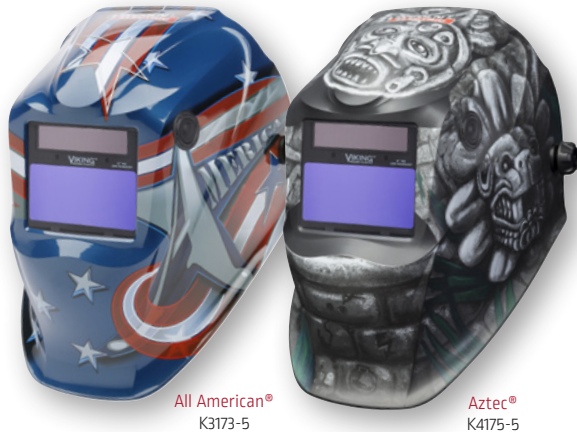
All American® K3173-5