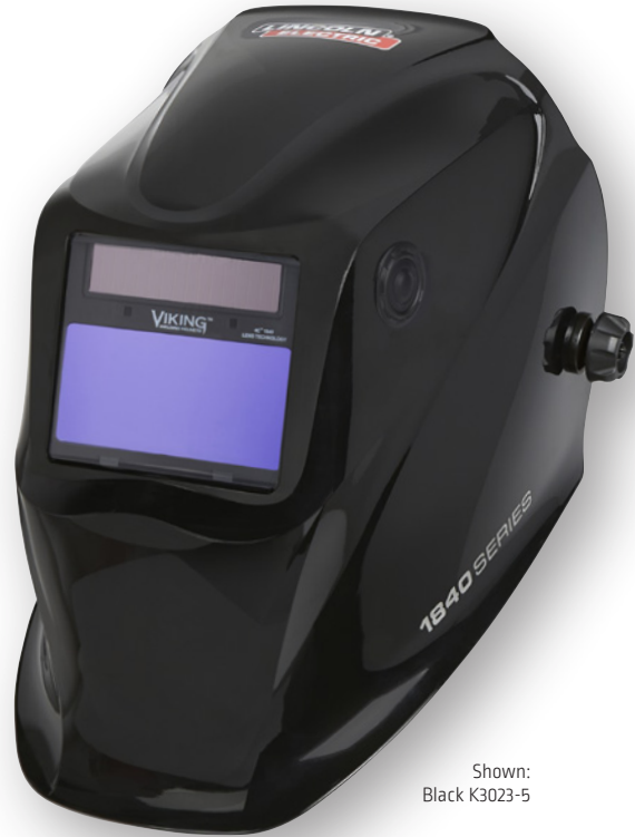
Shown: Black K3023-5