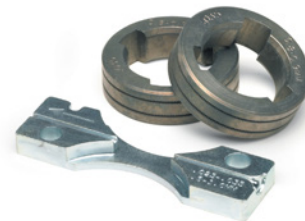
Shown: KP1697-035C, Cored Drive Roll Kit