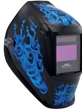
Blue Rage™ 296753