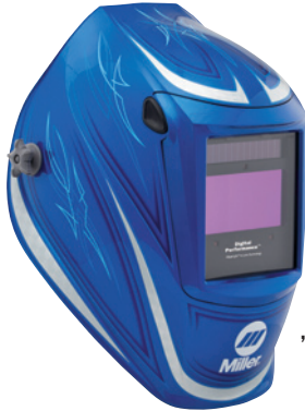
'64 Custom™ 296751